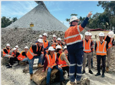
Rochester Secondary College School visiting for a site tour