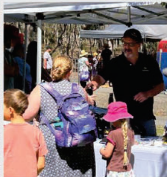
Axedale Quick Shear event