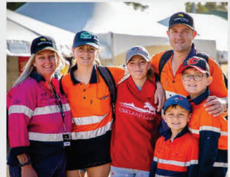
Open Day 2024